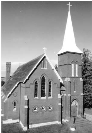
St. John's The Evangelist Church

websites: stjohntheevangelistca.archtoronto.org & stcorneliusca.archtoronto.org