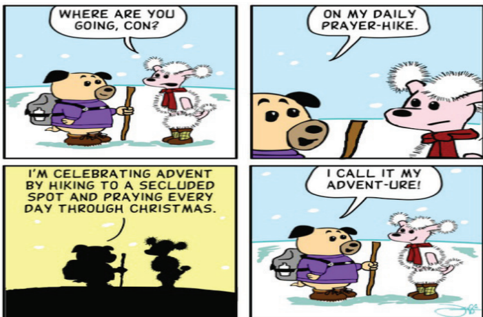
ADVENT IS A TIME OF ANTICIPATION, HOPE AND NEW BEGINNINGS.

Covid-19 contact tracing... although we have not had a need for contact tracing to date. The Cardinal has asked us to have a list of email addresses available to notify parishioners if/when the public health department tells us that there has been exposure. Please be sure that we have your email address by emailing us at stjohnalbion@bellnet.ca