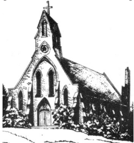
St. Cornelius, Silver Creek

16066 The Gore Road, Caledon, ON L7C 3E6