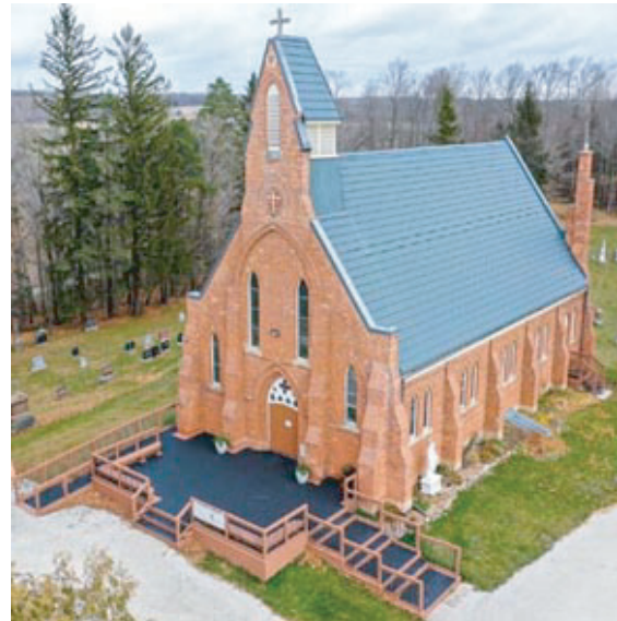
St. Cornelius, Silver Creek

16066 The Gore Road, Caledon, ON L7C 3E6