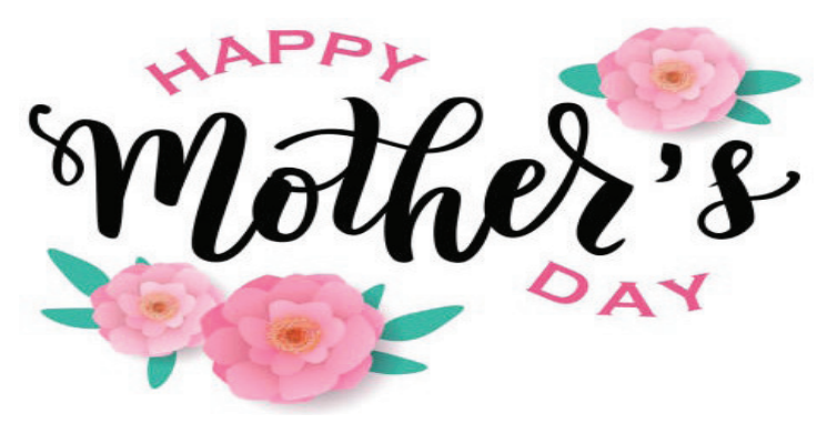
Today's Quote: Being a mother is learning about strength's you didn't know you had, and dealing with fears you didn't know existed.

Loving God, as a mother gives life and nourishment to her children, so you watch over your Church. Bless these women, that they may be strengthened as Christian mothers. Let the example of their faith and love shine forth. Grant that we, their sons and daughters, may honor them always with a spirit of profound respect.