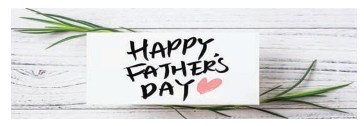
Today's Ouote: A father is someone you look up to, no matter how tall you grow.