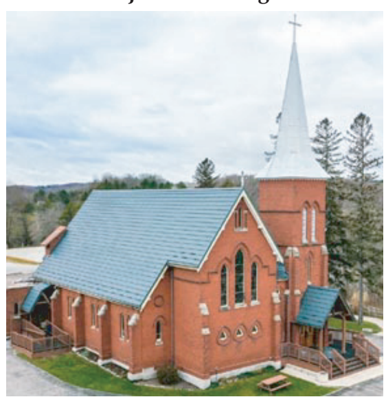
St. John's The Evangelist Church 16066 The Gore Road, Caledon, ON L7C 3E6

websites: stjohntheevangelistca.archtoronto.org & stcorneliusca.archtoronto.org