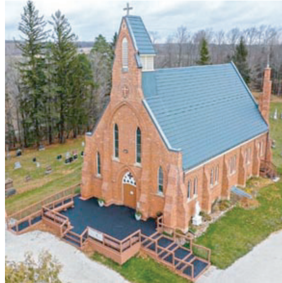
St. Cornelius, Silver Creek

OFFICE HOURS: Mon-Fri 9:00-5:00p.m.; Sat 1-6 p.m. & Sun 9-1:15 p.m.