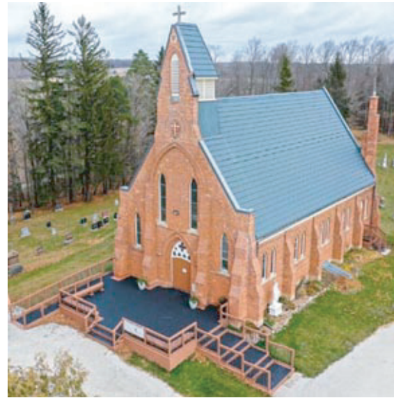
St. Cornelius, Silver Creek

OFFICE HOURS: Mon-Fri 9:00-5:00p.m.; Sat 1-6 p.m. & Sun 9-1:15 p.m.