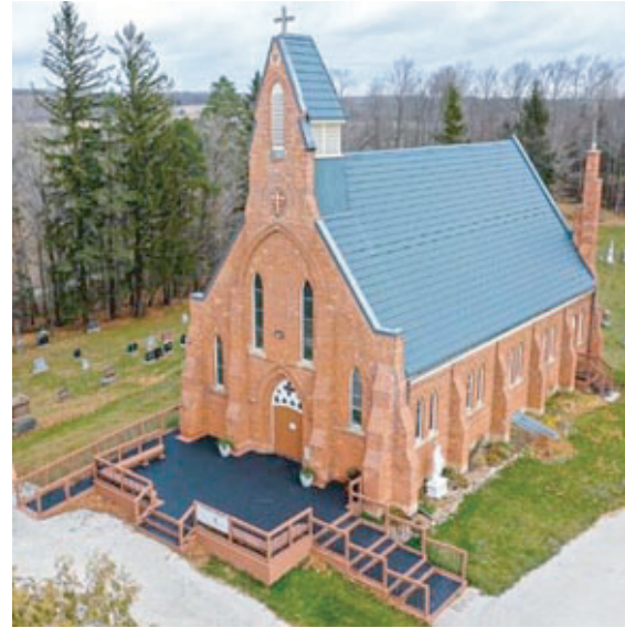
St. Cornelius, Silver Creek

OFFICE HOURS: Mon-Fri 9:00-5:00p.m.; Sat 1-6 p.m. & Sun 9-1:15 p.m.