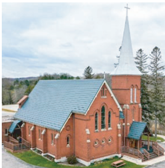
St. John's The Evangelist Church

websites: stjohntheevangelistca.archtoronto.org & stcorneliusca.archtoronto.org