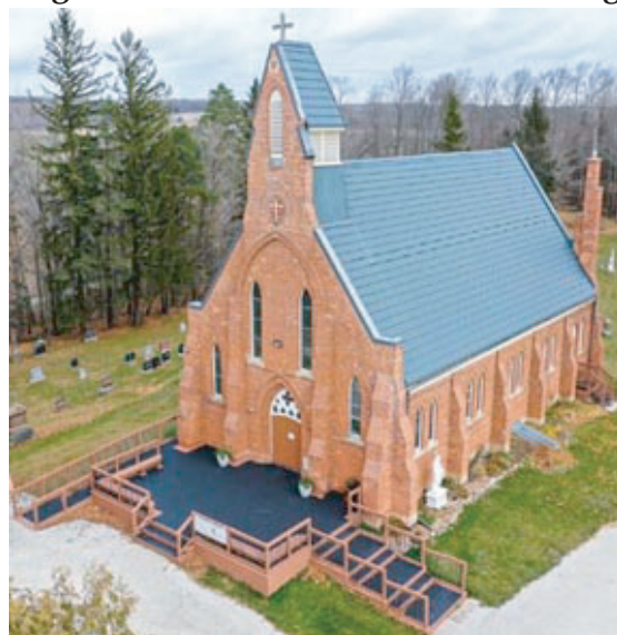
St. Cornelius, Silver Creek