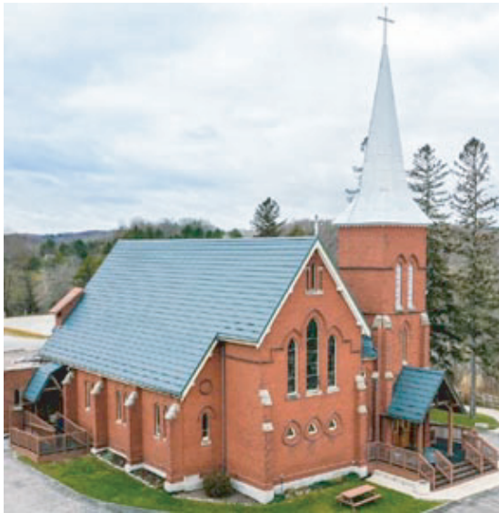
St. John's The Evangelist Church

websites: stjohntheevangelistca.archtoronto.org & stcorneliusca.archtoronto.org