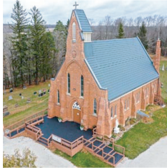
St. Cornelius, Silver Creek

OFFICE HOURS: Mon-Fri 9:00-5:00p.m.; Sat 1-6 p.m. & Sun 9-1:15 p.m.