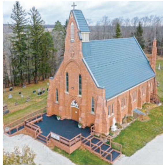
St. Cornelius, Silver Creek

OFFICE HOURS: Mon-Fri 9:00-5:00p.m.; Sat 1-6 p.m. & Sun 9-1:15 p.m.