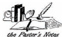
the Pastor's Notes

Communion Reflection... Life is filled with small annoyances that can sometimes cause us to lose perspective on what's really important. We all have occasional aches and pains along with the physical consequences of doing things for which we were long ago out of shape. Most of us just grin and bear it while some dwell on these annoyances to the point of forgetting what's also going well in their lives. Jesus spoke of our Heavenly Father as knowing whatever it is we need. He asked us to consider the passing beauty of the lilies of the field and pointed out that our Father will provide many more gifts of a permanent nature to each of us. While some say they believe this, they still complain constantly about life's little annoyances. Isn't it strange how those with genuinely serious troubles usually wear the biggest smile.